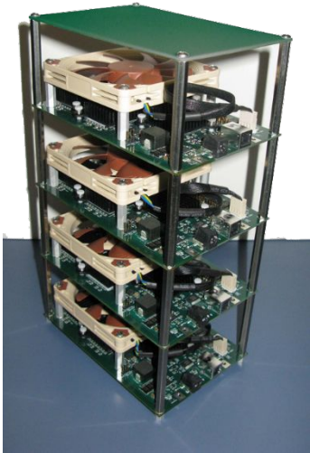
User Effort Interface 6.5THz Array